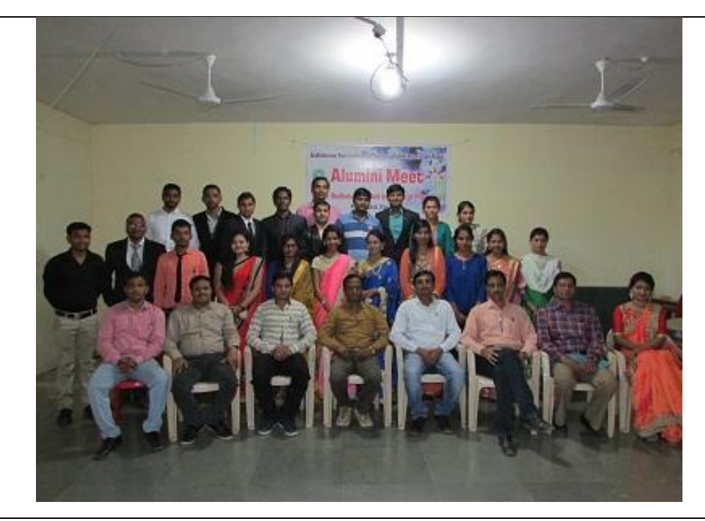
Alumni Meet: 2017-18